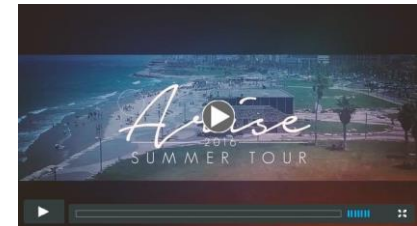
Arise Summer Tour 2016 - Expect the Unexpected